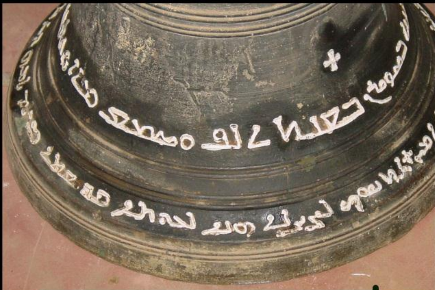
Kuravilangad ,St Marys Church,Syr. inscription on Bell,AD 1584